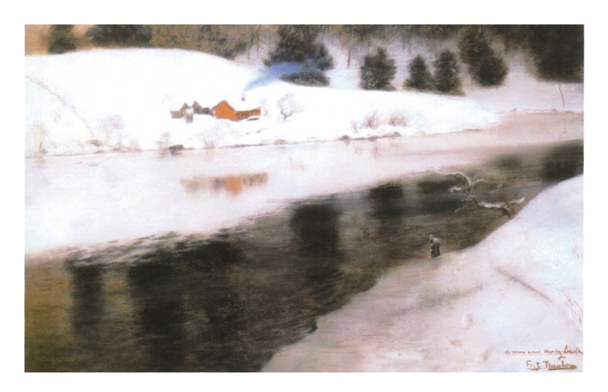
Example 2. Frits Thaulow, La Riviere Simoa en hiver.21

The painting ( La Rivière Simoa en hiver , see Example 2), despite a large area of white, shows dark and gloomy atmosphere, reinforced with the shadow of the trees reflected in the water.