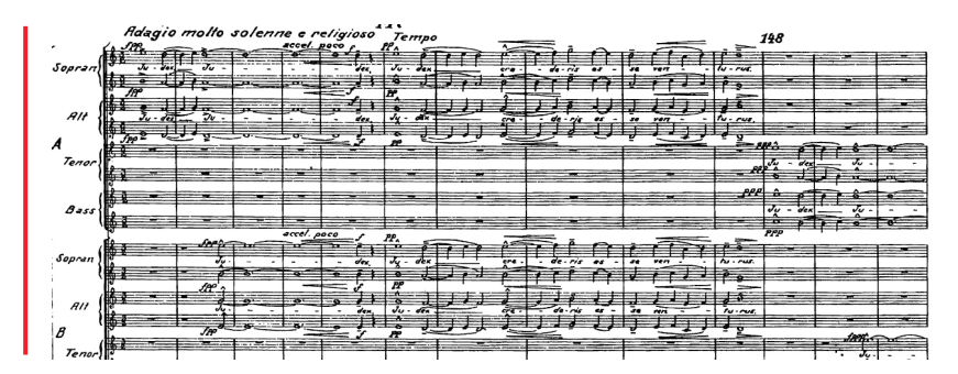
Ex. 3: H. Brian, Gothic Symphony, part V (Judex), bb. 1-13. A choir part.

In terms of the quality of play of engaged ensembles, the disproportion is noticeable. English choirs and orchestras pay much attention to articulation marks in the Brian's scores than Slovakian ones. The example could be again the fragment of part V with articulated marcato entrances of choir, perfectly heard in both English recordings (compare: example 3).