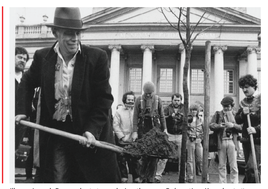
Illus. 1: Joseph Bueys plants trees during the 7000 Oaks action, Kassel 1982.19

The photograph below shows Joseph Beuys, an artist, a political and social activist. It commemorates the 1982 performance during which Beuys planted (with the help of local people) seven thousand trees of various species in Kassel. Next to each of them he placed a basalt pedestal. The dualism of living, organic matter and processed, inanimate matter was meant to illustrate Beuys's key philosophy of the harmony and coexistence of these values in the life of every human being.<sup>18</sup>