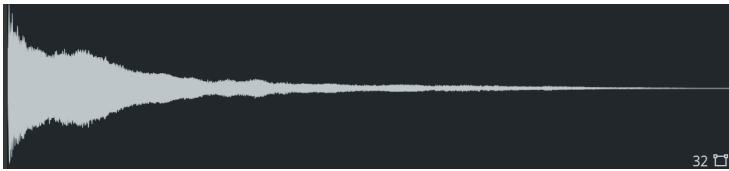
Ex. 1: Piano sample sound spectrum generated in FL Studio 20 demo.

This is the spectrum of one note played on the piano. Traditionally sound spectrums are divided into four parts: the attack—the beginning of the sound, decay—the general decay of volume, sustain—the phase in which the lower volume remains steady, and release—the last part, where the sound dissolves into nothingness. The picture presented below does not present the ideal four stages, but it is possible to discern a few phases: